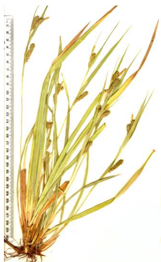
Carex gunniana . Tasmanian Herbarium specimen.