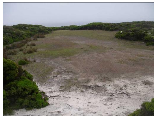
Cotula vulgaris var. australasica habitat: saline herbfield in Seal Rocks State Reserve, King Island.

Cotula vulgaris var. australasica may be more widespread than records indicate as the species is easily overlooked. A reassessment of the species’ status may be warranted following targeted surveys.