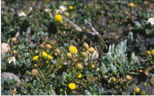
Cotula vulgaris var. australasica H & A Wapstra