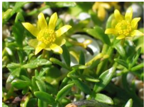
Plate 1. Flowers and leaves of Ranunculus diminutus from Victoria