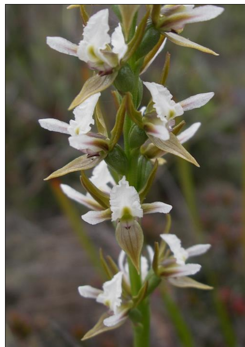
Plate 1. Prasophyllum apoxychilum