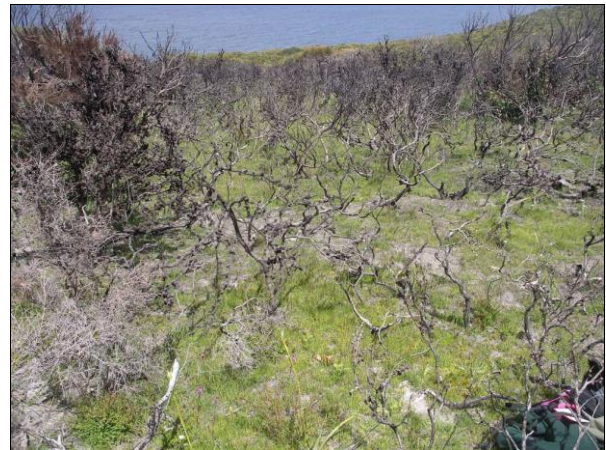
Plate 2. Prasophyllum apoxychilum habitat on the Pineapple Rocks Track, January 2011, with plants flowering eight months after fire

habitat of Prasophyllum apoxychilum , though the extent of the impact on the species is unknown. The housing ribbon beyond Eaglehawk Neck towards Doo Town and towards Taranna may well have been a stronghold for this species prior to the clearing of private blocks for housing. Land clearing is not identified as a specific threat to any subpopulations with precise location information at present though other subpopulations remain at risk from clearance and benign neglect.