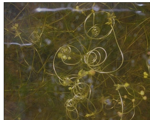
Left: Ruppia tuberosa habitat: pools and channels in succulent saltmarsh near Lauderdale (October 2016); top right: turions; bottom right: fruiting plant with coiled flower stalk (the white spherical swellings are galls, possibly a pathological response to a fungus (Brock 1982b))