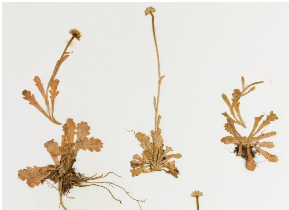
Figure 1. Brachyscome radicata : part of the collection from Mount Inglis (HO 92667; scanned image courtesy of the Tasmanian Herbarium)

Short (2014) considered naming at least the Mount Inglis material as a separate variety due to its distinctive scape vestiture, but refrained from doing so because of the considerable variability in both the Tasmanian and New Zealand collections. Further material is needed from Tasmanian sites to shed light on the variation within and between subpopulations