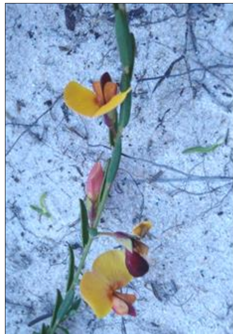
Plate 1. Bossiaea heterophylla