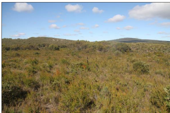
Plate 2. Habitat of Bossiaea heterophylla