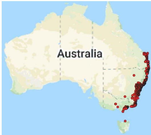
Figure 2. Distribution of Bossiaea heterophylla ( Atlas of Living Australia , downloaded 26/9/2018)

In Tasmania Bossiaea heterophylla is found in coastal heath on sand at the margin of dry and wet heath (Plate 2), with plants growing larger in the wetter areas. Associated species include Acacia suaveolens , Acacia verticillata , Allocasuarina paludosa , Astroloma humifusum , Banksia marginata , Bossiaea cinerea , Dillwynia glaberrima , Epacris impressa , Gompholobium huegelii , Hibbertia sp., Hypolaena fastigiata , Lepidosperma concavum , Leucopogon virgatus , Pimelea linifolia , Platylobium triangulare and Xanthorrhoea arenaria .