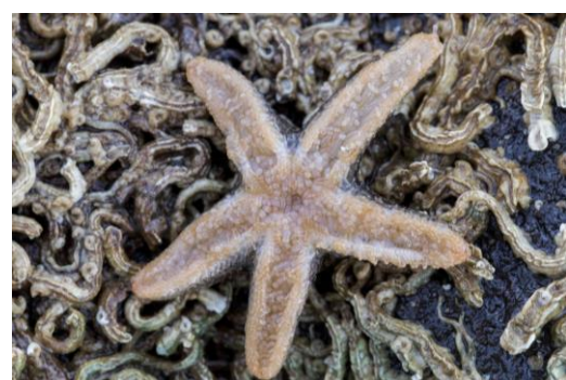
Plate 1. Bruny Island seastar TOP: upper view of three specimens BOTTOM: underside view