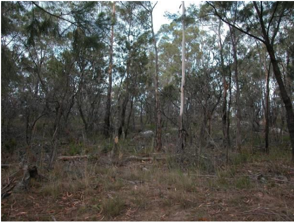
Plate 4. Chaostola skipper habitat at Knocklofty: heathy Eucalyptus amygdalina woodland on sandstone, Gabnia radula as the food plant.