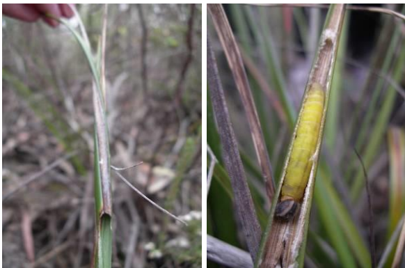
Plate 3. Larval shelters of the chaostola skipper in Gabnia radula .

Little is known of the species' local movements; however, the chaostola skipper is likely to be territorial and females able to fly large distances to lay eggs (Wainer & Yen 2009). Despite an apparent strong flying ability, it is unlikely that the species could successfully move between known subpopulations due to large expanses of unsuitable habitat separating them.