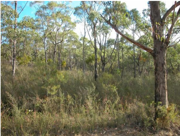
Plate 5. Chaostola skipper habitat in the Peter Murrell Reserve: heathy Eucalyptus amygdalina woodland on sandstone, with Gabnia radula as the food plant.