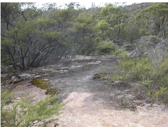
Plate 6. Chaostola skipper habitat on Freycinet Peninsula: open woodland on granite, with Gabnia microstachya and G. radula as the food plant.

These communities occur on relatively infertile substrates derived from sandstones, mudstones, siltstones, granites or windblown sands (Neyland and Bell 2000).