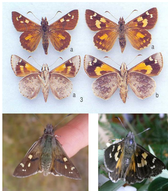
Plate 1. Antipodia chaostola (top) a: subspecies chares b: subspecies chaostola (left) male subsp. leucophaea (right) female subsp. leucophaea