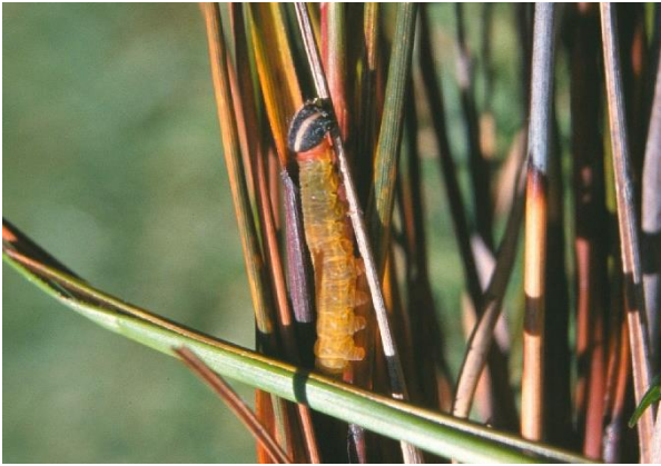
Plate 2. Larvae of the chaostola skipper feeding on Gabnia microstachya .